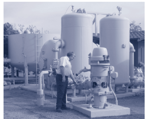
One of several groundwater wells.

In the last several years, our treatment plant and computer monitoring controls were extensively upgraded to meet tough new quality standards. The District's water quality professionals and consulting engineers are now undertaking a review of the laboratory and other processes to make sure that we meet increasingly strict drinking water quality standards.