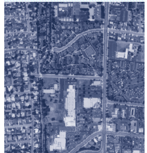
Aerial GIS photo of Goleta.

The District's engineering department is overseeing creation of a computerized program—called Geographic Information System (GIS)—to create digital maps that represent the location of roads, pipelines and buildings. This mapping system will include zoning information; system details such as pipe size, location, and age; customer data; and other engineering information. The GIS information will allow staff to maintain and improve the system more efficiently. The 3-D aerial photographs that are at the heart of GIS were taken in cooperation with other local agencies, saving our ratepayers money.