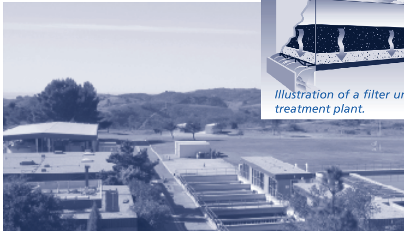
Goleta Water District's Corona del Mar treatment facility.

Goleta Water District has only one job—to provide our customers with plenty of high quality water at a reasonable price. We focus all of our knowledge and resources on this single goal. This page describes some highlights of our efforts in this area.