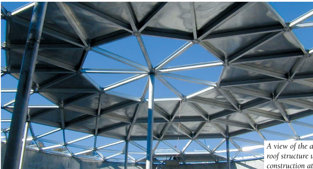
A view of the aluminum roof structure under construction at Patterson reservoir.

Half the cost of the $3.6 million project is being paid by a state grant. The project is on target for completion in the fall of 2004.