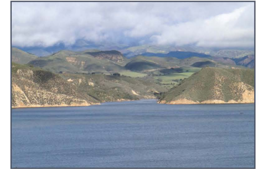
WINTER 2023 - 100%