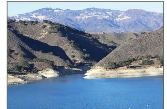
FALL 2022 - 31%

Santa Barbara County has received 194% of normal rainfall for the current water year. This above-average rainfall led to Lake Cachuma reaching 100% of capacity . The District has received 100% of its Cachuma water supply allocation for the current year. The District will inject surplus water supplies into the Goleta Groundwater Basin to prepare for future water shortage emergencies and meet customer needs.